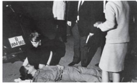
In Bed with Terror - Deep State Operations of the Cold War

Producer Wolfgang Bergmann, Co-produced with WDR, WDR/ARTE, Filmstiftung NRW, DFFF, Filmförderung HH-SH 100/59 min., HDSR, Digital Betacam, 16:9, cinema release 2012